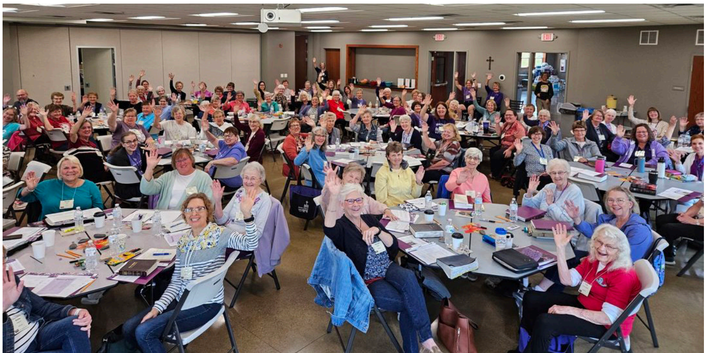
The ladies took a quick break from Bible study to wave hello from the LWML Fall Retreat, held Sept. 16 at Camp Omega.